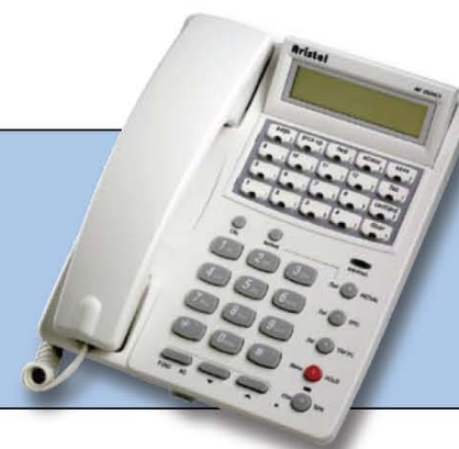
NOVA KP 70 W