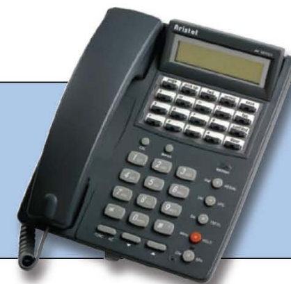
NOVA KP 70 G