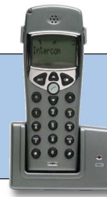
SUPERNOVA KP 50 DBW